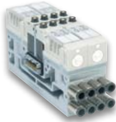
Side ported manifold design

Only 6 total valve part numbers makes selecting valves easy and concise.