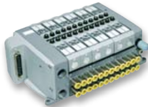
Bottom ported manifold design